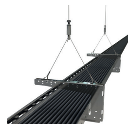
With UniGrip Y-Fit