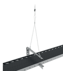
With Hook Y-Fit Accessory