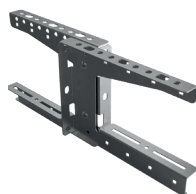
Back to back